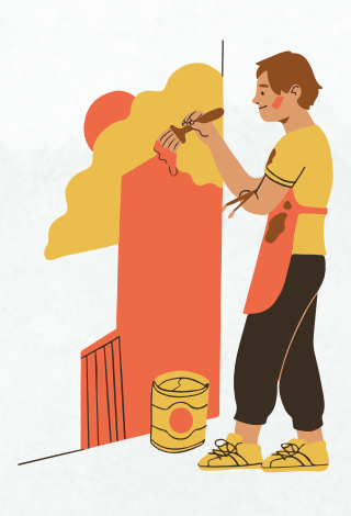
Increase public art.