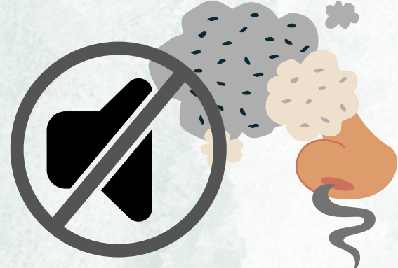
Decrease sound, soot, and smell nuisances.