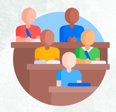
Build better public participation in government decisions.