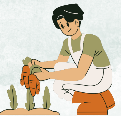
Make it easier for community gardens.